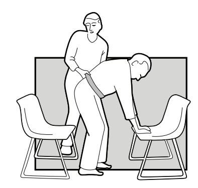
5) Place a second chair behind the person. Ask them to push up with their arms and legs, then sit back in the chair behind. Guide them into the seat. Do not lift them.