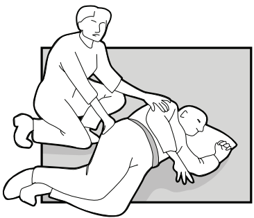
1) It is important that the fallen person does the work.